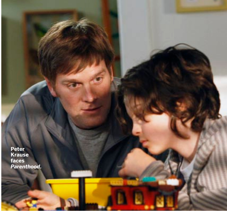
Peter Krause faces Parenthood .