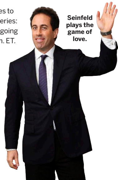
Seinfeld plays the game of love.

The Marriage Ref (NBC) Get ready to see your favorite celebs playing marriage counselors on this new reality show, executive-produced by Jerry Seinfeld. Marriage ref/host/comedian Tom Papa and "experts" including Alec Baldwin, Tina Fey, Eva Longoria, and Charles Barkley officiate real-life marriage disputes—for better or worse! Thursdays, 10 p.m. ET.